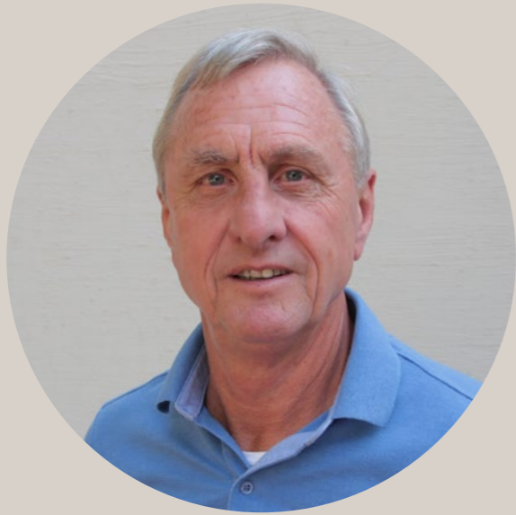
Johan Cruyff Founder